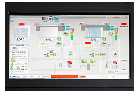
19" touchscreen display